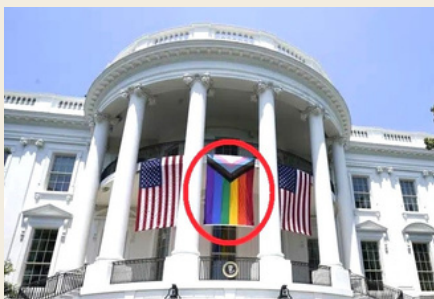
White House - Memorial Day, May 2023